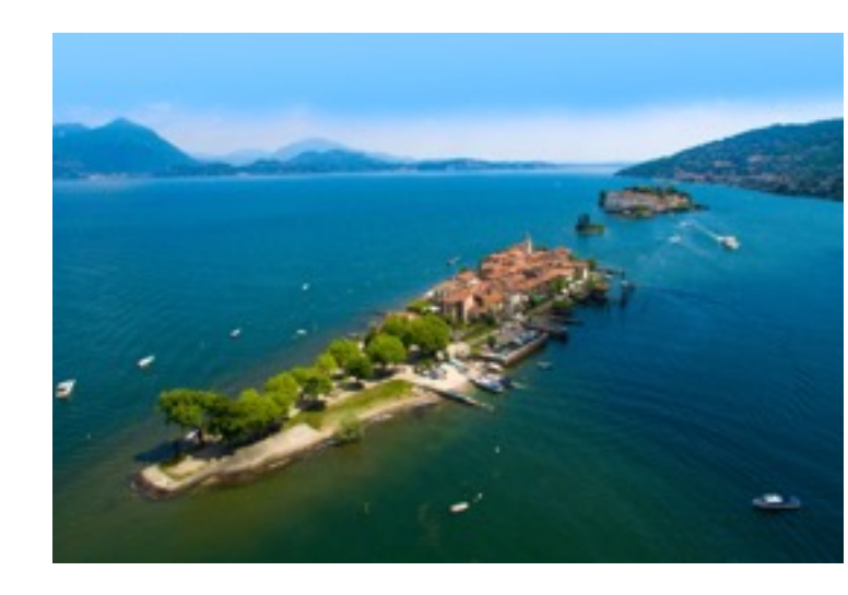
Isola Bella Isola Madre Isola Pescatori