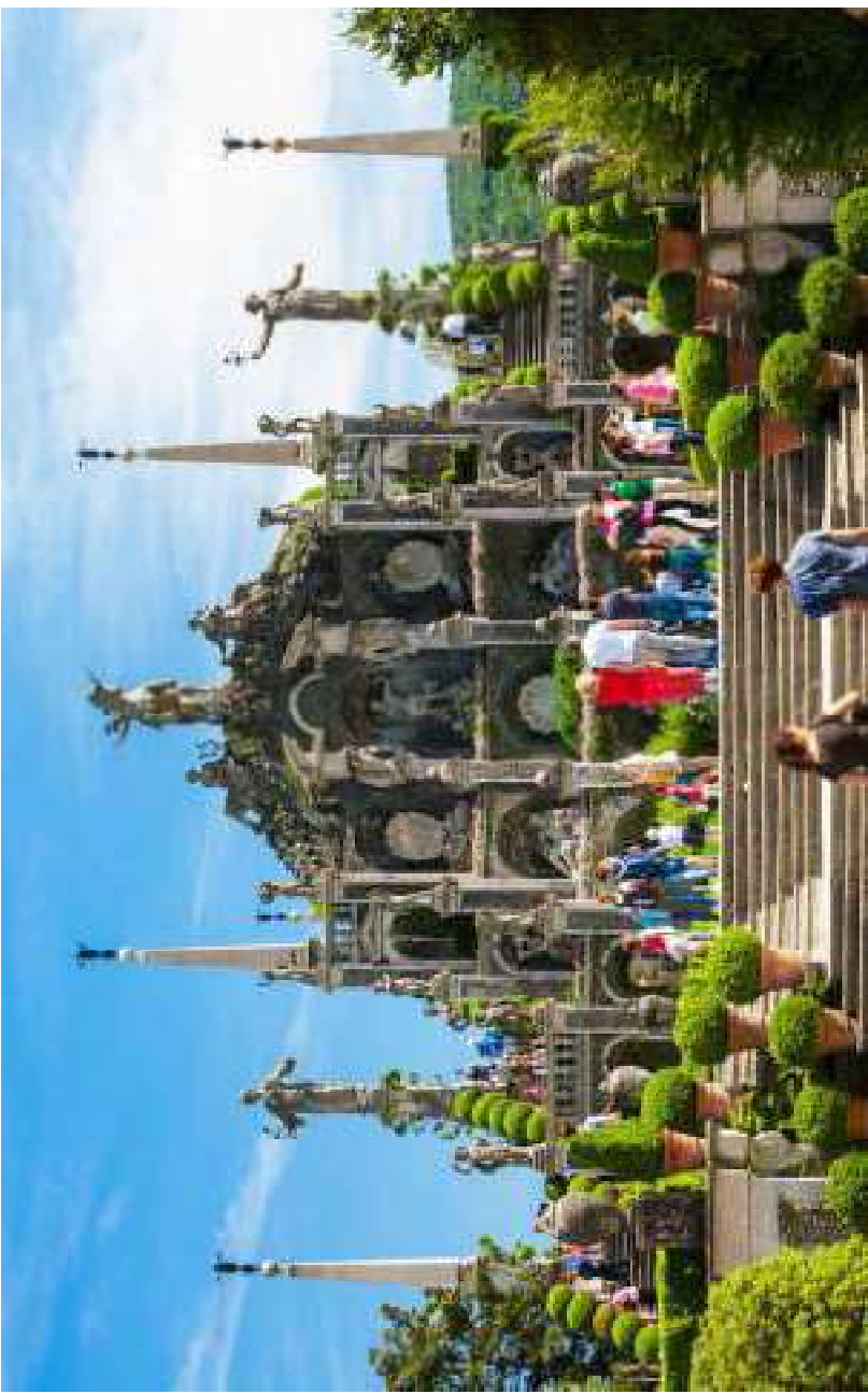
The spectacular gardens at Isola Bella are a must-see

https://www.telegraph.co.uk/travel/tours/ultimate-itineraries/perfect-italy-holiday-lake-district-como-garda/