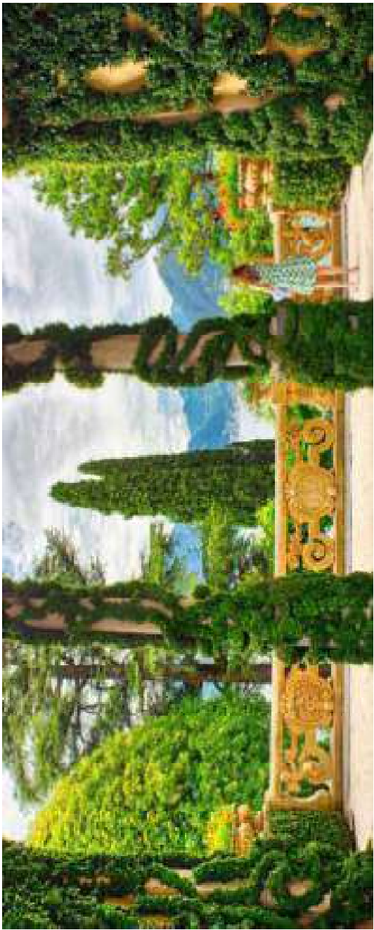
Take in extraordinary views of Lake Como at Villa del Balbianello