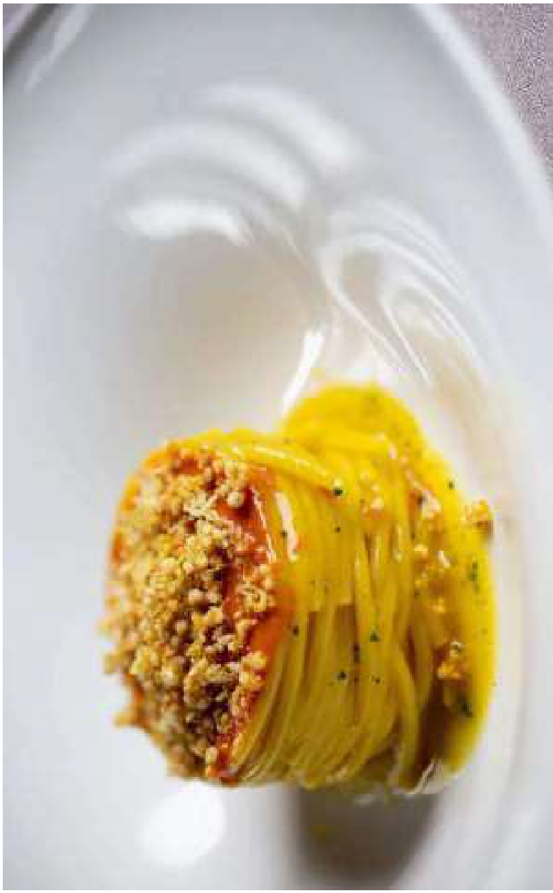
Dine at three-Michelin starred Villa Crespi on Lake Orta

https://www.telegraph.co.uk/travel/tours/ultimate-itineraries/perfect-italy-holiday-lake-district-como-garda/