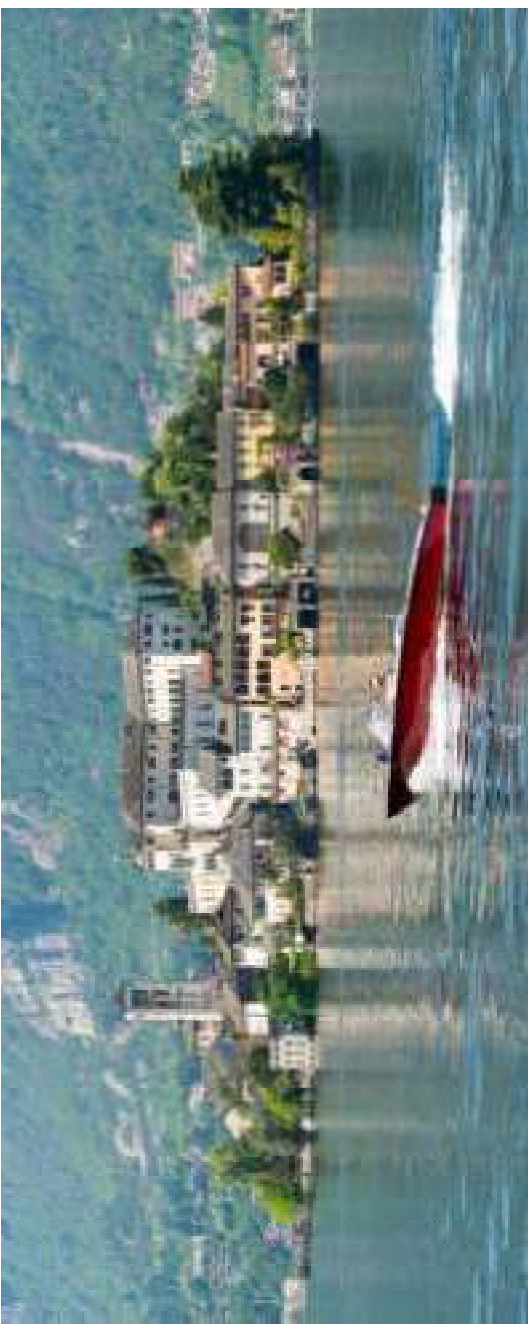
Lake Orta, the smallest of the Italian Lakes, still holds much to discover